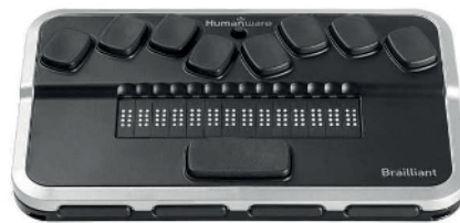
Figure 2: A Braille keyboard