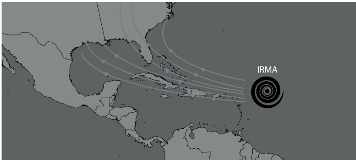
Figure 3: Potential tracks of Hurricane Irma

The European computer model, run by the European Centre for Medium-Range Weather Forecasts, performed far better than the American model, known as the Global Forecast System. However a new model created by the electronics company Panasonic , called PWS, performed best.